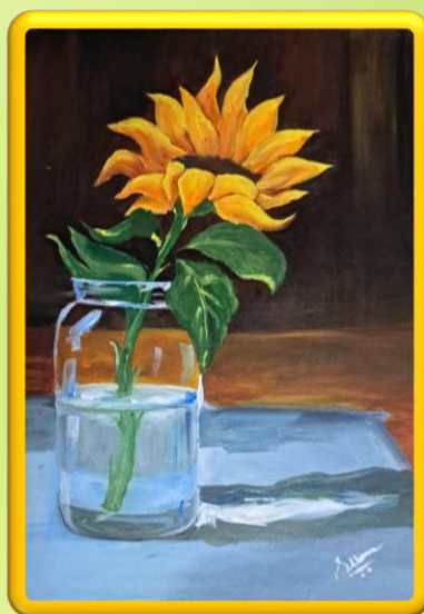
Saketh – IX