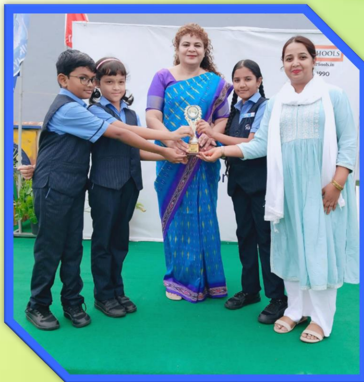
Ashoka House (Junior)