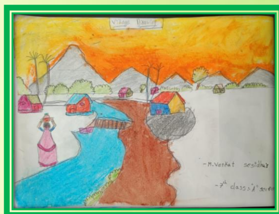
Venkat Sesidhar – VII A