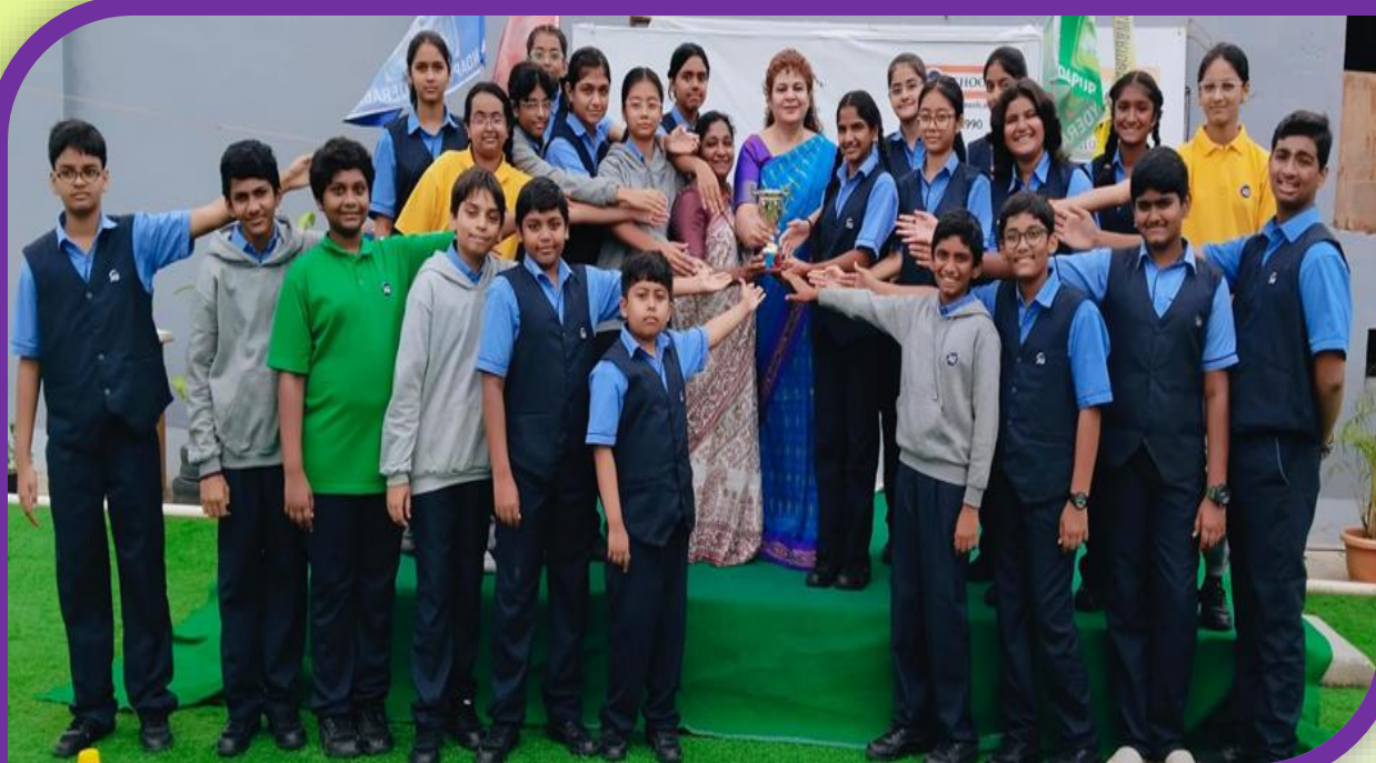
Grade- VIII (Senior)