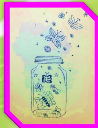
Shreyasi – VIII