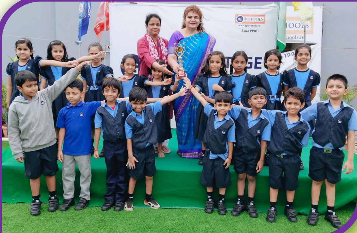
Grade- I B (Junior)