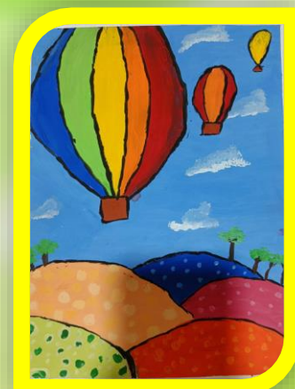
Saranya – VI B