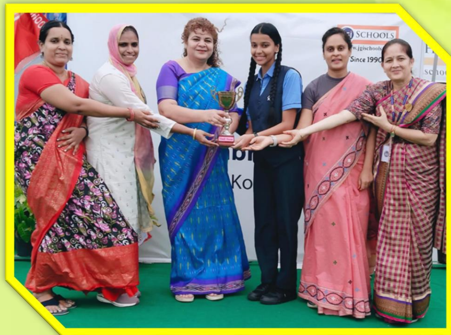
Abhay House (Senior)