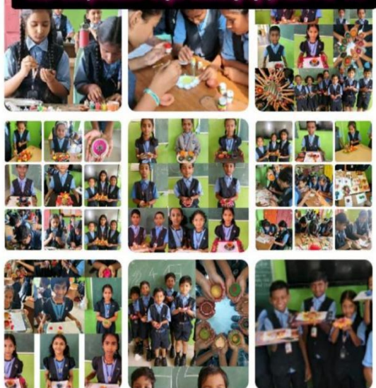
CCA Competition: Diya Making by Grade 1 to VII

JHCS Shamirpet hosted a vibrant and creative Diya making competition, celebrating the traditional art that lights up homes during festive times. Students from Grade 1 to Grade VII showcased their talents, infusing life into clay with their tiny, dexterous hands.